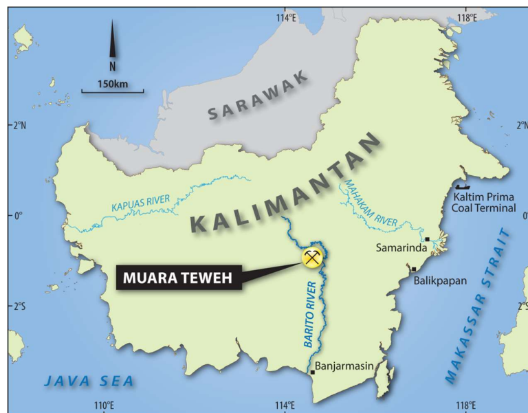
Figure 1: Location Map of BPCI Mine

BPCI has successfully commissioned, mined coal and exported coking coal as such has all permits to conduct its mining business.